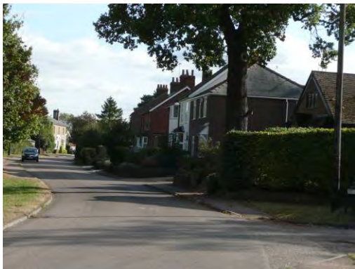
Fig 20: Heath Road, Breachwood Green

265. The village has a central core with outlying areas of development to the north and south. One of these is the older development along The Heath and the other is the more recent development around Mill Way. The village has spread out east and west from its central core to accommodate newer housing and wrap around the green open space behind the chapel.