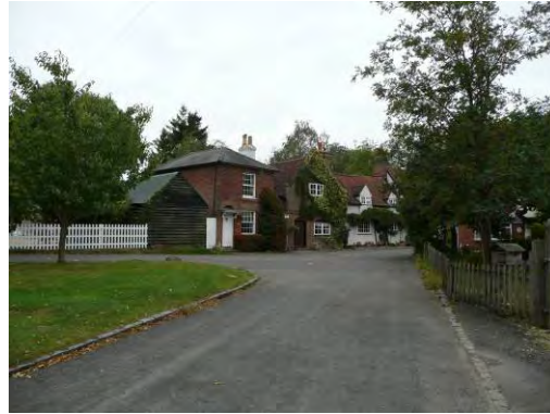
Fig 30: The Green, Preston

342. Some of the character of Preston has been preserved by its old buildings particularly around Preston Green which forms the heart of the village. The school is located away from the centre on the western edge of the village. The church lies closer to the centre on Church Lane. The centre of the village, where the pub and village green are situated, is on the eastern edge overlooking the grounds of Princess Helena College. The village pond is on the opposite side of Preston Road to the village green. The conservation area covers all these features, incorporating most areas to the north, south and east of the village.