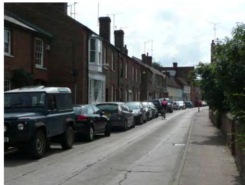
Fig 25: High Street, Kimpton

314. As the village lies either side of a road that runs along the valley bottom the village's impact on the landscape is reduced. Wooded areas beyond the village restrict long views out of the village to the north and south.