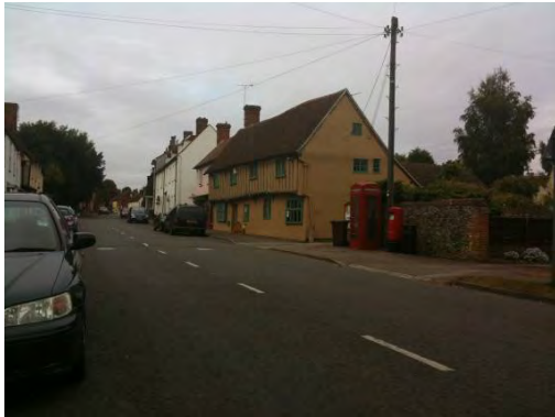
Fig 18: Historic Buildings along Barkway High Street