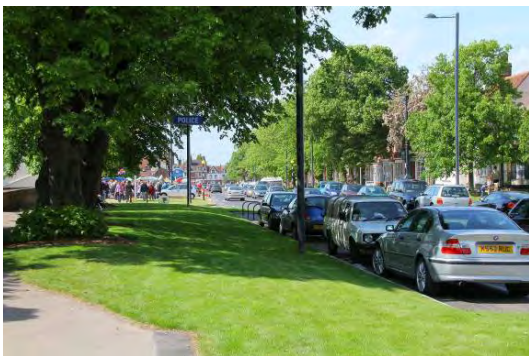
Fig 13: Baldock's wide High Street

160. In 2008 enhancement works were carried out to the public realm in the town centre. The enhancements rationalised the car parking, created new public realm spaces using high quality materials to give the centre a large village character.