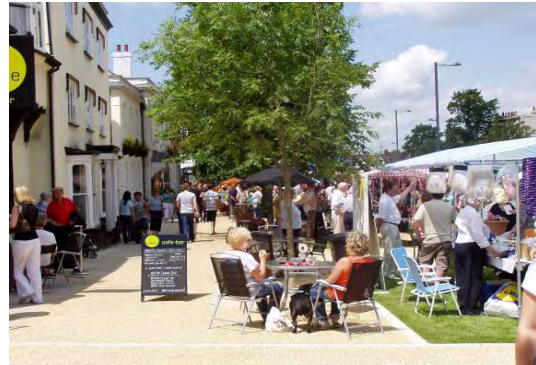
Fig 11: Market taking place in Baldock High Street

use as places but taking into account safety and everyday use.