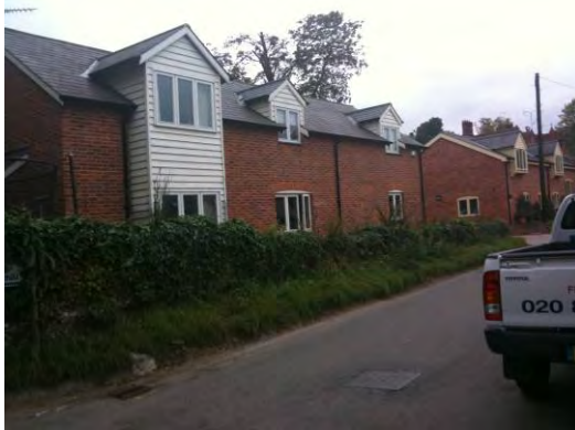
Fig 19: A more recent development along Church End, Barley.

259. There has been some more recent infill and cul-de-sac development within the village core but the defining features have largely been respected and development has been sympathetic to the local character.