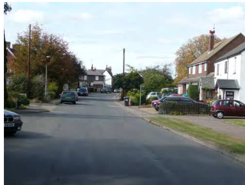
Fig 28: High Street, Offley

338. In the village there are several timber and render cottages with tiled roofs of the 16 th and 17 th centuries and some later brick buildings.