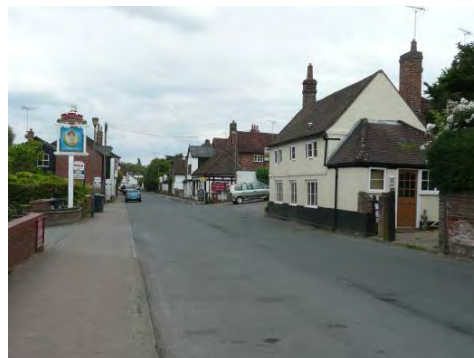
Fig 38: High Street, Whitwell

406. Further information can be found in the Whitwell Village Design Statement.