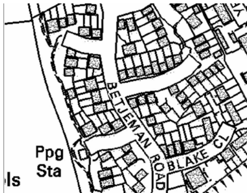
Fig 10: Example of use of cul-de-sacs in Royston, which restrict pedestrian and vehicular movement

123. New development should have good connections with the existing network, maintaining flows and maintain routes for travel. Culs-de-sac and gated developments offer the least amount of permeability. Straight line block development, although offering the greatest level of permeability and direct routes, can encourage higher speeds.