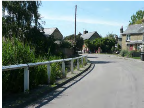
Fig 29: Village pond and the High Street, Pirton

open character of this large undeveloped area within the village and safeguards views.