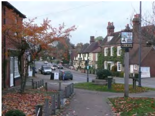
Fig 21: High Street, Codicote

273. The conservation area lies to the west of the village covering the High Street, Heath Lane and Old School Close.