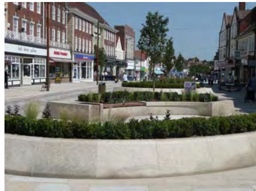
Fig 15: Leys Avenue, Letchworth Garden City

194. The Design SPD aims to ensure a high standard of design is maintained in keeping with the character and sense of place of Letchworth Garden City. The Garden City Design Principles have been consistently applied for many years. They encourage various aspects of design to be considered in particular detail when considering development in Letchworth Garden City. The design principles may also be used to good effect in other places although consideration needs to be given to particular character and sense of place.