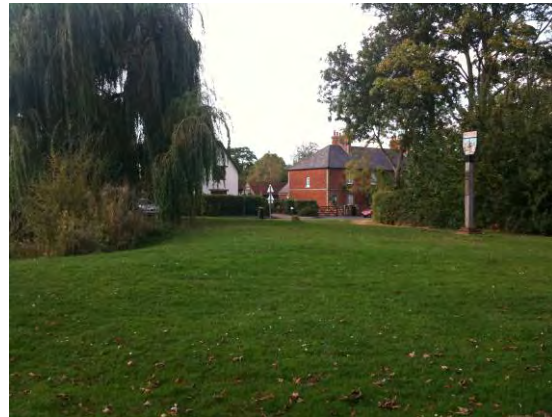
Fig 37: The central green space in Weston

396. Weston lies on the top of a ridge providing attractive long views out to the surrounding open countryside. The centre of the village still feels historic, however as you move away from the central area newer development begins to influence the character. There is a mix of property types, a large percentage of which are large and detached.