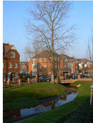
Fig 7: The William Ransom site in Hitchin was built at over 90 dwellings per hectare, making use of its town centre location and proximity to the railway station

87. Higher densities can support public transport and ensure developments are making an efficient use of land. This can be viewed as reducing the environmental impacts of a development. This can sometimes result in taller buildings, which should not dominate the street scene and negatively affect the character of an area