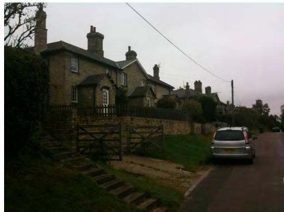
Fig 36: Character Cottages in Therfield

387. The oldest buildings in the village are character-type properties with generally thatched or red tiled roofs, set in large plots away from the road. There are also groups of 19 th Century cottages, built with yellow brick and grey slate roofs set slightly back from the road.