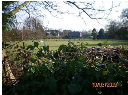
Fig 32: Central square in Reed is a mix of paddocks and scattered dwellings

355. The rural setting and the open nature of the village dominates the sense of place. The older part of the village is located on a southern facing slope of the chalk hills. The post-war and more modern properties with a more regular layout are located towards the A10. Some more modern farm building conversions are located to the north of the village although development around the square has largely been resisted retaining the unique character.