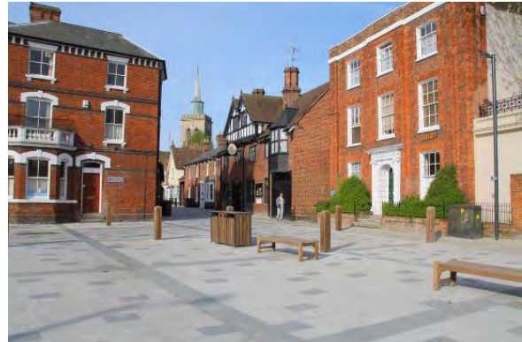
Fig 9: Well positioned, functional street furniture in Baldock

105. Street furniture should not impact on accessibility. Public realm should be enjoyable for all potential users and poorly located signs and furniture could impinge on the movement of wheelchair and pushchair users.