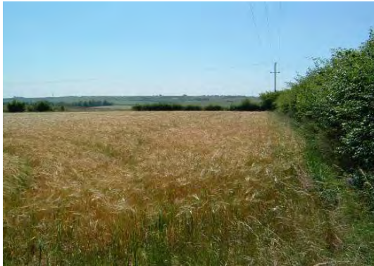
Fig 2 – A view of the rural edge of Royston

10. The North Hertfordshire district is predominantly rural, incorporating 375km 2 of attractive undulating countryside following the chalk escarpment of the Chiltern Hills and the East Anglian Heights. The district contains four main settlements; the historic market towns of Hitchin, Baldock and Royston and the world's first Garden City, Letchworth. There are also 33 villages varying in size from Knebworth, which contains in excess of 4,000 people to Caldecote with a population of roughly 20. There are also a number of hamlets and scattered dwellings throughout the rural area.