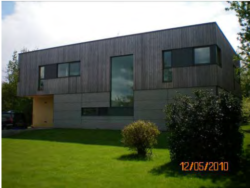
Fig 12: Recently built eco-home at Holly Lodge Farm, Wallington, includes solar panels, passive solar gain, a sedum roof and efficient hot water / heating system.

149. Various different types of technologies will be employed as the Code For Sustainable home is implemented through the Building Regulations.