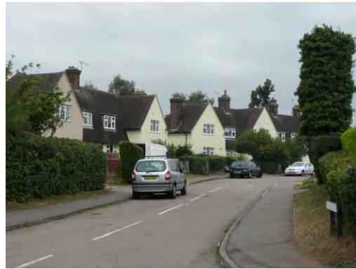
Fig 34: The Crescent, St Ippolyts

ground which is hidden behind the housing. Gosmore is centred on High Street/ Maydencroft Lane and part of Waterdell Lane where the village green is located with later development spreading north along Hitchin Road and eastwards. More recent housing has been infill plots. The Parish Hall and shop are located in a location central to both settlements..