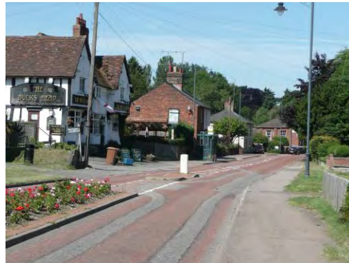
Fig 27: Stevenage Road, Little Wymondley

331. Little Wymondley is a well contained small village with the public houses located near the junction of Stevenage Road and Priory Lane. Stevenage Road contains a diversity of building styles and ages which are linked by the mature hedge and tree planting within front gardens giving a green character to the road.