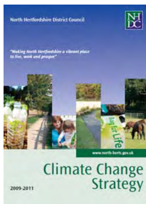
Fig 4: North Herts Climate Change Strategy

41. At the local level the Council signed the Nottingham Declaration on Climate Change in 2007, which amongst other things acknowledges the issue of climate change and commits the Council to work to reduce carbon emissions and prepare a Climate Change Strategy. 4