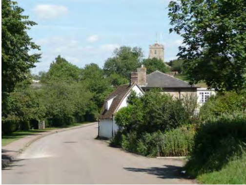
Fig 35: View of the Church of St Ippolyts

379. Gosmore has a more closely knit character than St Ippolyts and is not constrained by its topography. The facilities, shop and pubs are distributed around the settlement and not concentrated in one location.