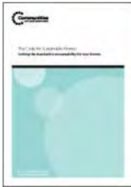
Fig 5: Code for Sustainable Homes

46. The Code is the national standard for the sustainable design and construction of new homes. The Code aims to reduce our carbon emissions and create homes that are more sustainable.