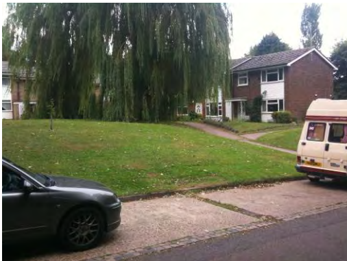
Fig 22: Greenspace and offstreet parking in more recent development to the west of Graveley

281. There is a mixture of types of housing in Graveley. The more modern developments are located in parcels to the west of the village, towards the A1, which forms a natural barrier to any future development.