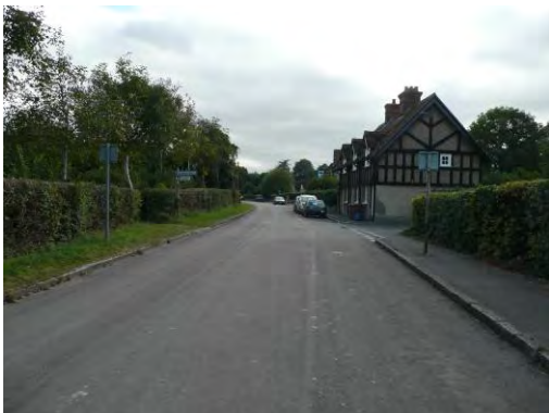
Fig 23: Mill Lane, Hexton

293. Local commercial activity is well integrated into the village which is still largely an estate village.