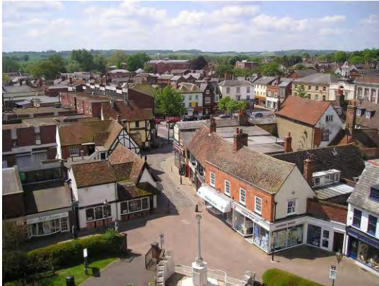
Fig 8: Hitchin Town Centre has maintained a unique historic character

91. Areas with a coarser grain have larger blocks of development and less inter-connecting streets and junctions.