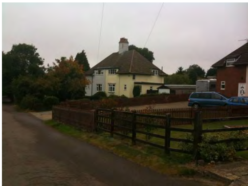
Fig 33: Garden City style development in Sandon

360. The majority of the housing has been built since the 1930's. There is predominantly ex-local authority development around the triangle area between Dark Lane, Payne End and Rushden Road. The centre of the triangle area contains mostly "Garden City" Style housing.