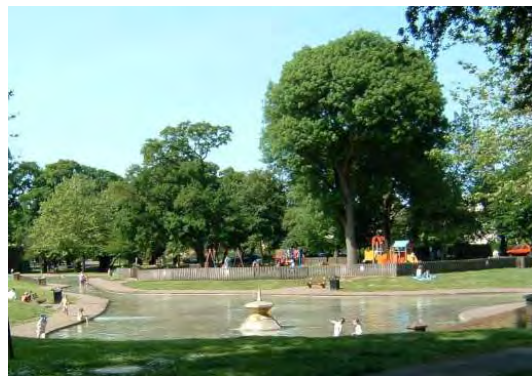
Fig 1: Howard Park and Gardens, Letchworth Garden City is a well used space

8. It goes on to state ‘Urban design is a key to creating sustainable developments and the conditions for a flourishing economic life, for the prudent use of natural resources and for social progress.’