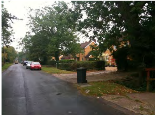
Fig 31: More modern development in Reed includes hedgerows, front gardens and additional verges plus on-street and off-street parking

349. There would appear to be a strong influence of the late 19 th Century in the village although roughly a third of the houses in the village have been constructed since 1950.