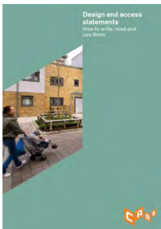
Fig 3: CABE's Design and access statements guidance

30. CABE have produced useful advice on preparing Design and Access Statements in Design and Access Statements how to read, write and use them 2