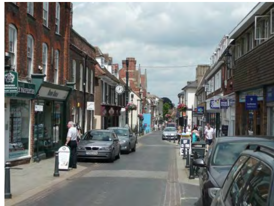
Fig 16: High Street, Royston

224. The views of the Grade I Listed St John's Church should be protected and where possible enhanced.