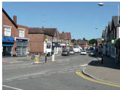
Fig 26: London Road, Knebworth

323. Opportunities to create new public spaces within the centre should be explored such as to the rear of the street frontage (Lowe's yard) and within the set-back along Station Road.