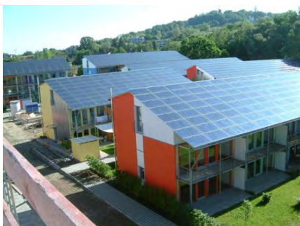
Fig 6: Use of photovoltaics on roofs in Freiberg, Germany

70. These technologies convert sunlight to electricity and can be integrated into buildings. They tend to have no moving parts and are silent. They can be incorporated into buildings in various ways on sloped roofs, atria and shading devices.