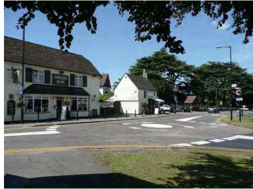
Fig 24: Green Man public house, Arlesey Road, Ickleford

302. Traditional and 20 th century buildings line the main roads. Local amenities such as the church, school, pubs and shops are located in the centre of the village. The village has gateways at the north (the railway bridge) and at the south (bridge over the River Oughton on Old Hale Way). To the east of the church newer development has tended to be located in short cul-de-sacs off the main road. To the west of the church newer development has more of an estate character with cul-de-sacs leading off loop roads.