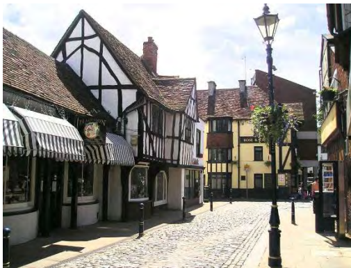
Fig 14: The Churchyard area of Hitchin

The town centre is totally included within the Conservation Area. A few modern buildings detract from the character of the historic environment.